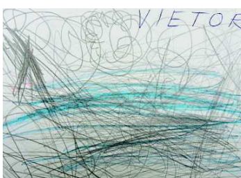
Figure 5 Drawing of the wind II