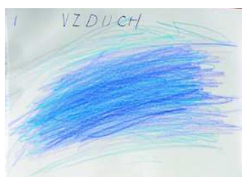
Figure 1 Drawing of the air I