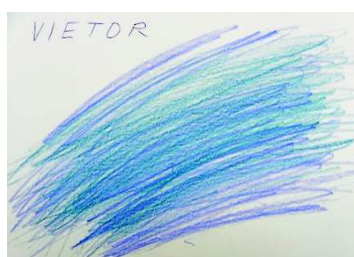
Figure 4 Drawing of the wind I