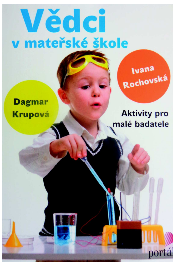
Figure 10 The publication Scientists in Nursery School

All of the designated attributes have their place, especially in the proposed developmental program which we have presented in the publication, Scientists in Nursery School (Rochovská, Krupová, 2015), and we believe that it will be happily used in kindergartens.