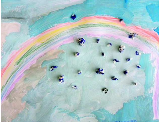
Figure 8 The resulting product – Rainbow I