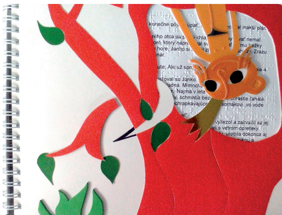
Fig. 4: Žirafia mama a iné príšery/Giraffe Mum and Other Creatures (2015), book illustration by Emília Blašková, unpagéd

Therefore, it is obvious that the experimentality of these books does not lie only in the artistic innovation of the illustrations. It is a mere change of philosophy in relation to blind people. Slovak artist Emília Blašková is the illustrator of the book Žirafia mama a iné príšery/Giraffe mum and other creatures 23 (Salmela, 2015) in the version for the blind. In the haptic as well as in the non-haptic illustration of this book, she uses cut-outs in paper through which the subsequent pages can be seen or at last guessed at (Fig. 4). The author justifies the use of this creative principle as follows: “‘Hatches’ are considered as the opening of the page (image – illustration) to the spaces ‘beyond seen/beyond seeing’. At this moment, I find several meaning layers for a sighted and a blind person.” 24