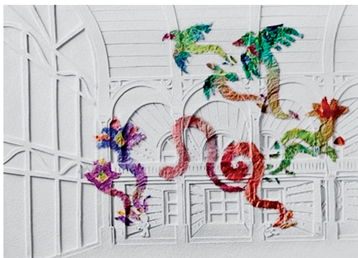
Fig. 3: El cuento fantasma (2012), book illustration by Hsu Wen Chen, unpagged

Another book, El cuento fantasma 22 (Gamboa, 2012), is a fairy-tale about the ghost of a never read story, who hides in a dark corner of the library. He feels himself inferior to the ghosts of other and more famous stories. In a formula that is always repeated when someone approaches (“I’m a phantom, no one sees me, I’m a phantom.”) he expresses the humble acceptance of his own predispositions and fear of interaction that is experienced by many blind people. The ghost-story ultimately finds its reader – a blind girl who helps him to appreciate his uniqueness and value. The book is interesting not only by the literary idea, but also by its visual processing. An individual diversity of ghost-stories is reflected in deliquescent rainbow swirls of felt paper, which trace the relief of the library space created by the stacking of cuttings from white paper (Fig. 3). This stylization of the architectural environment is subordinated to the optical phenomenality of the material objects and applies strict laws of perspective. This haptic information might be “at a first touch” confusing for a blind person, but might also be a source of knowledge about visual perception and visual culture.