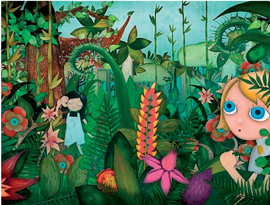
Fig. 1: Mimi a Liza (2013), book illustration by K. Kerekesová, B. Šíma and I. Šebestová, p. 92–93

These fairy-tales represent the friendship between a sighted and a blind girl, who, due to their contrasting natures, also discover the diversity of the world and life's peculiarities together (Fig. 1).