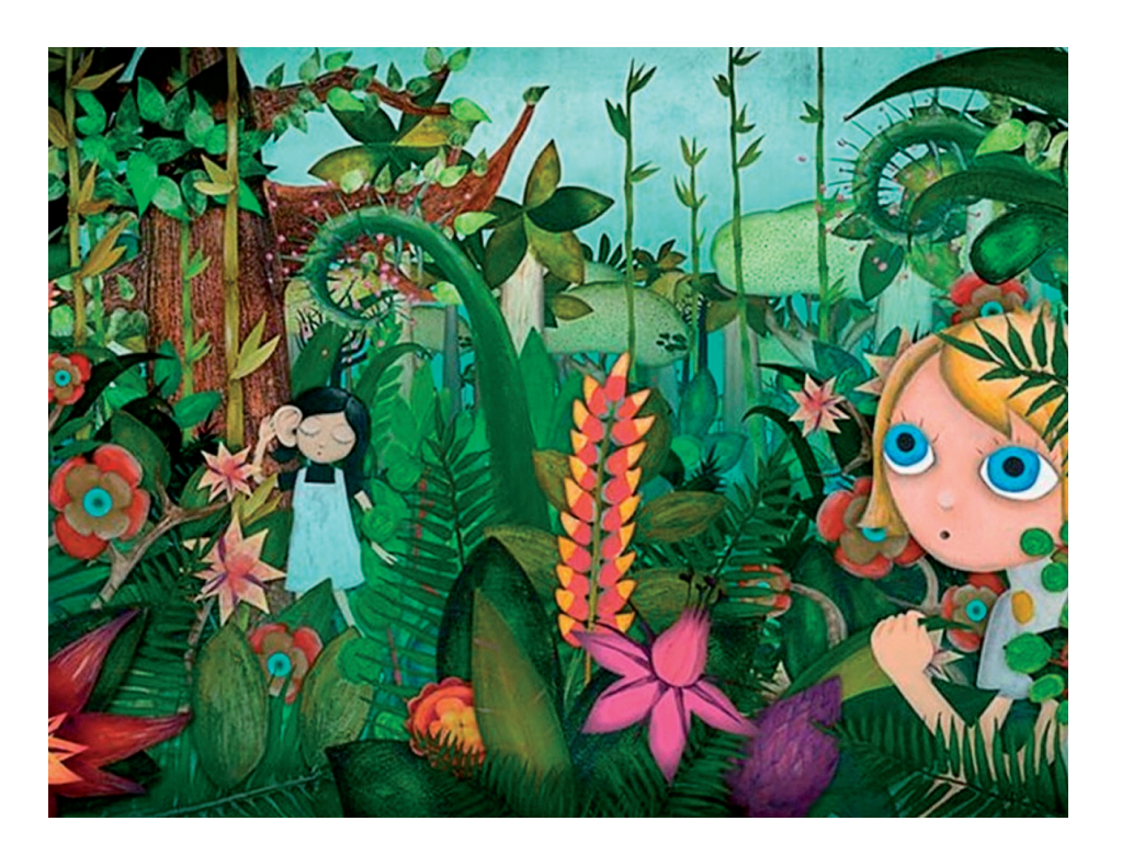
Fig. 1: Mimi a Líza (2013), book illustration by K. Kerekesová, B. Šíma and I. Šebestová, p. 92–93

These fairy-tales represent the friendship between a sighted and a blind girl, who, due to their contrasting natures, also discover the diversity of the world and life's peculiarities together (Fig. 1).