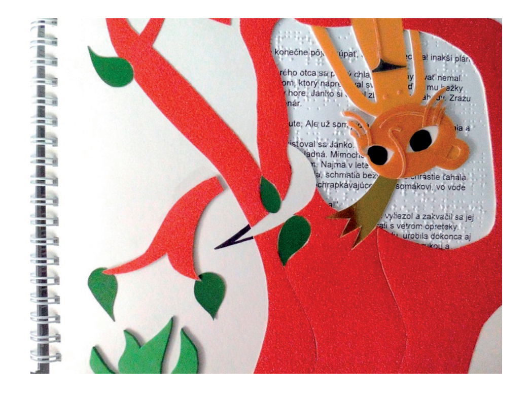
Fig. 4: Žirafia mama a iné príšery/Giraffe Mum and Other Creatures (2015), book illustration by Emília Blašková, unpaged

Therefore, it is obvious that the experimentality of these books does not lie only in the artistic innovation of the illustrations. It is a mere change of philosophy in relation to blind people. Slovak artist Emília Blašková is the illustrator of the book Žirafia mama a iné príšery/Giraffe mum and other creatures <sup>23</sup> (Salmela, 2015) in the version for the blind. In the haptic as well as in the non-haptic illustration of this book, she uses cut-outs in paper through which the subsequent pages can be seen or at last guessed at (Fig. 4). The author justifies the use of this creative principle as follows: "'Hatches' are considered as the opening of the page (image – illustration) to the spaces 'beyond seen/beyond seeing'. At this moment, I find several meaning layers for a sighted and a blind person."<sup>24</sup>