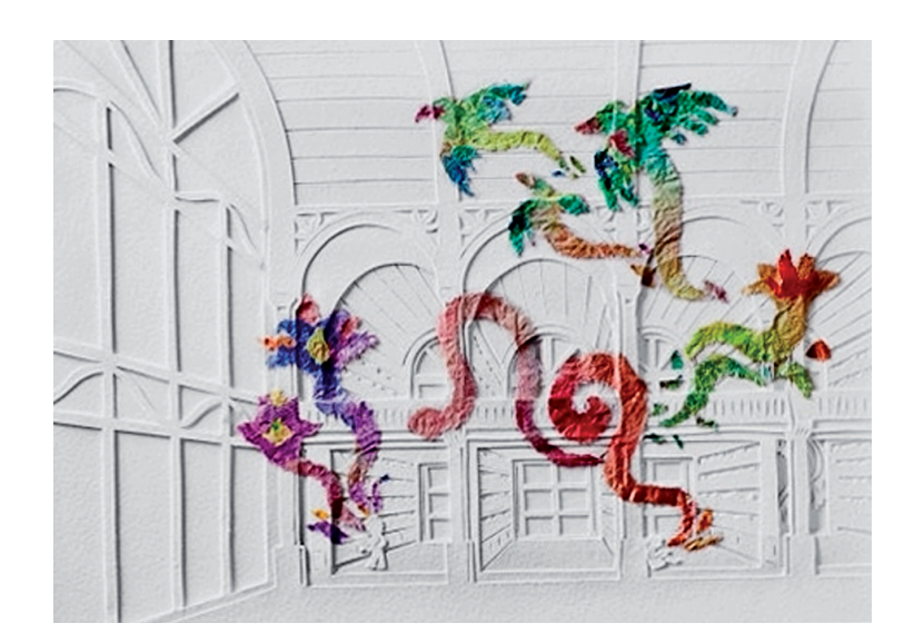
Fig. 3: El cuento fantasma (2012), book illustration by Hsu Wen Chen, unpaged

Another book, El cuento fantasma <sup>22</sup> (Gamboa, 2012), is a fairy-tale about the ghost of a never read story, who hides in a dark corner of the library. He feels himself inferior to the ghosts of other and more famous stories. In a formula that is always repeated when someone approaches ("I'm a phantom, no one sees me, I'm a phantom.") he expresses the humble acceptance of his own predispositions and fear of interaction that is experienced by many blind people. The ghost-story ultimately finds its reader – a blind girl who helps him to appreciate his uniqueness and value. The book is interesting not only by the literary idea, but also by its visual processing. An individual diversity of ghost-stories is reflected in deliquescent rainbow swirls of felt paper, which trace the relief of the library space created by the stacking of cuttings from white paper (Fig. 3). This stylization of the architectonical environment is subordinated to the optical phenomenality of the material objects and applies strict laws of perspective. This haptic information might be "at a first touch" confusing for a blind person, but might also be a source of knowledge about visual perception and visual culture.