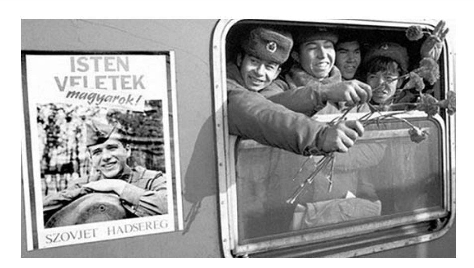
Figure 1. The poster on the left reads "Good-bye, Hungarians! The Red Army"