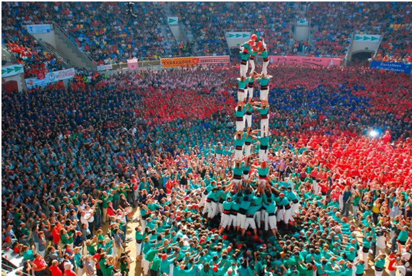
Figure 2. Human Towers: A Visual History of a Catalan Tradition