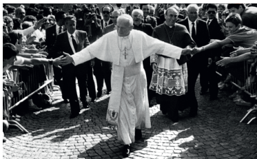
Without barriers.