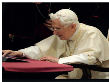
Benedict XVI.