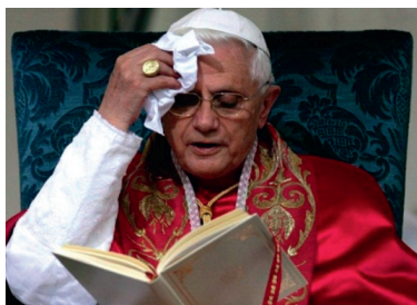
Exploration.

Due to the scale and nature of the new “Areopagus” mentioned by John Paul II, Benedict XVI called it “continento digitale”, a digital continent in which the Gospel must be preached with enthusiasm. Benedict XVI: for a Catholic, the Internet is like a “courtyard of the Gentiles” 7 in the temple of Jerusalem, a meeting place for believers and nonbelievers in a fruitful dialogue.