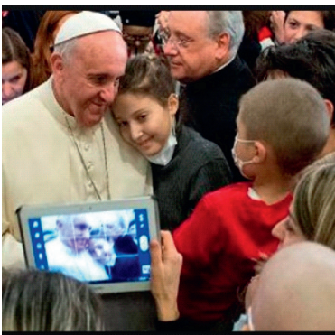
The closest encounters.