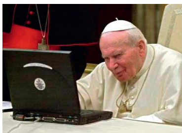
John Paul II.