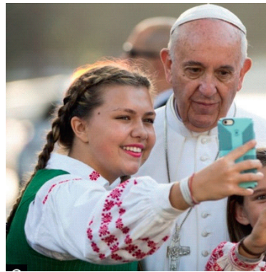
Selfie with the Pope.