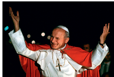
A global pilgrim.