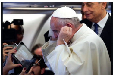
Francis.