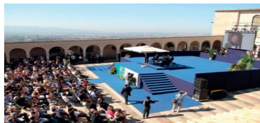
A debate with the Gentiles.