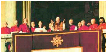
Urbi et Orbi from a distant country.

Already in 1990, John Paul II wrote that with the advent of computer communication techniques, a new computer culture was born. The Church received new means of carrying out her mission, the ability to inform the world more quickly about its “credo” and to explain its position to every problem or event. However, John Paul II called it the “Areopagus” of the modern world.