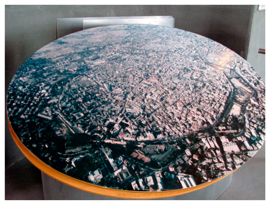
Photo 3. The fortifications of Nicosia seen from a bird's eye view in a contemporary urban setting. Overview board located at the vantage point of the Shacolas Tower Museum and Observatory in Nicosia.